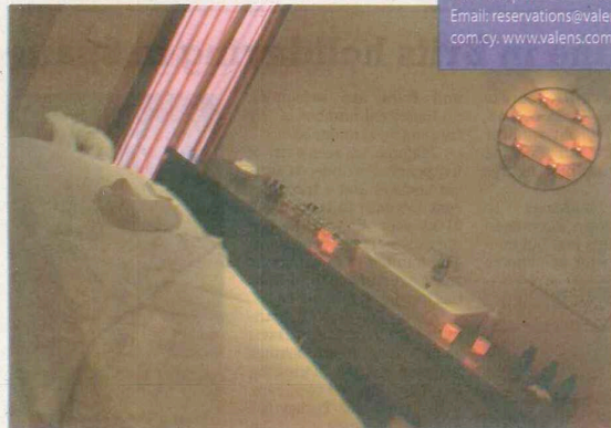
After The Rain's spa uses unique ingredients. Above and top right: some of the treatment rooms

17 Kasou St, Nicosia. Monday-Friday 9.30am-8pm. Saturday 9am-4.30pm. Tel: 7776677. Email: reservations@valens.com.cy. www.valens.com.cy